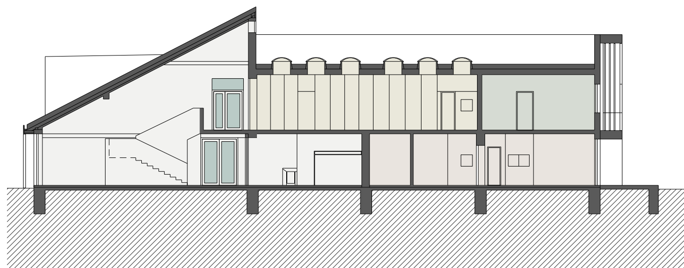
ŘEZ A - A'